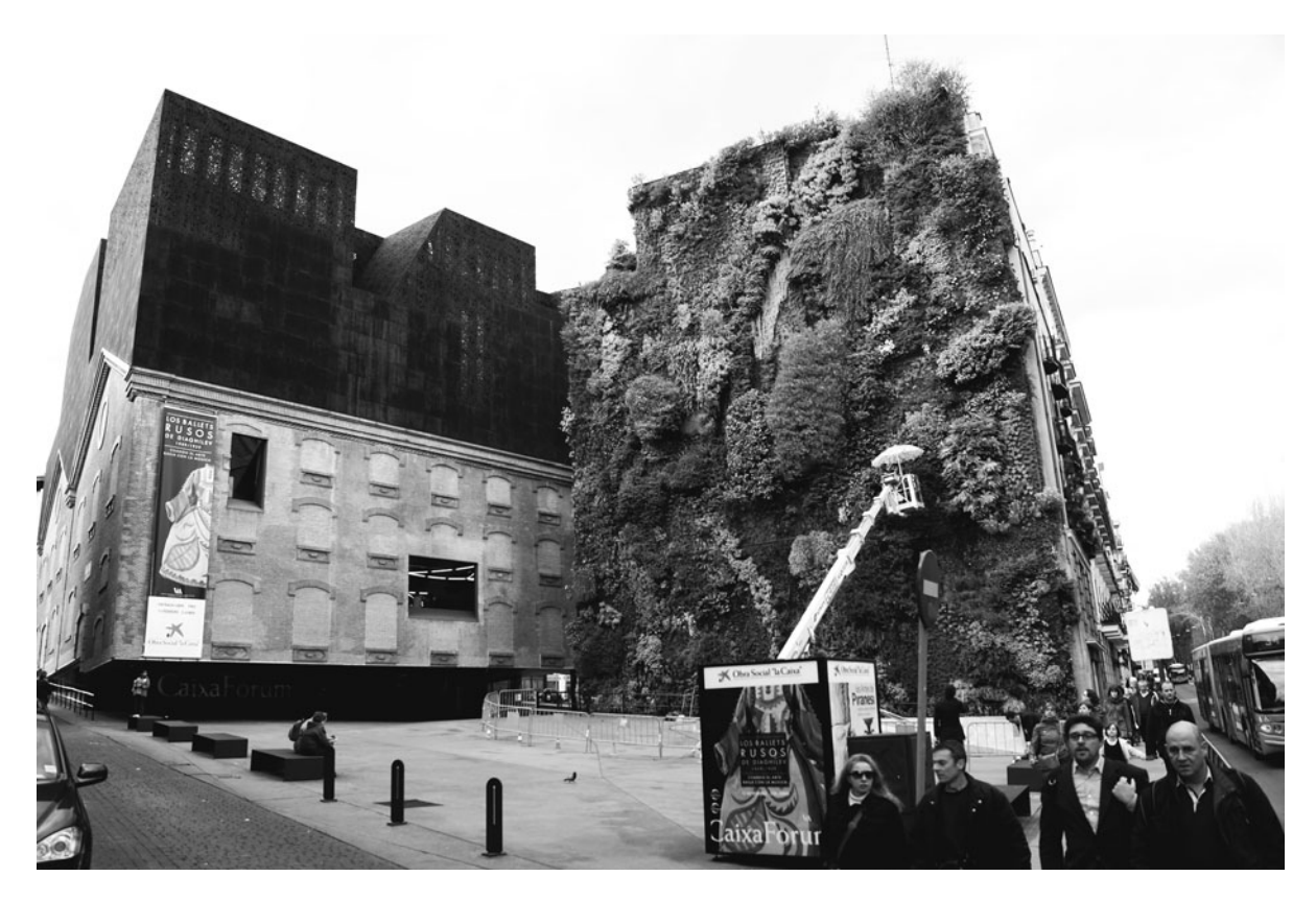
Fig. 2 Living wall in the city of Madrid, Spain.

We live in a world where most people live in cities and novel ecosystems outnumber wildlands. We do not mean to suggest abandoning the traditional practice of biodiversity conservation, but at the same time, we agree with other authors who have suggested other