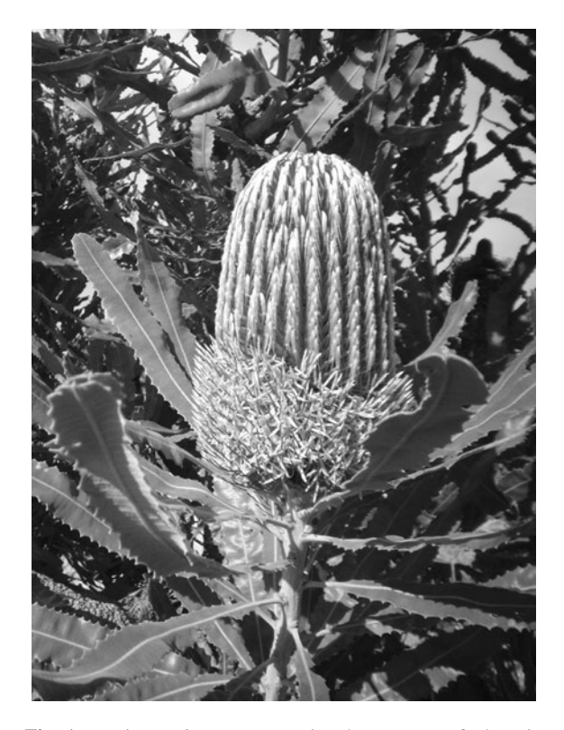
Fig. 1 Iconic Banksia menziesii invoke a sense of place in Perth, Western Australia

More generally, the high species diversity evident in urban landscapes owes a great deal to the varied management decisions of its household gardeners (Gaston et al. 2005; Grimm et al. 2008). Indeed, gardens reveal a diversity of preferences for nature, which are often driven by socio-economic status (Hope et al. 2003; Pedlowski et al. 2003) or cultural norms (Head et al. 2004). Modern multi-cultural cities are likely to include a wide variety of gardens and gardeners. So rather than prescribing management options for gardens, we can probably assume that some people will choose to plant native species in their gardens while others will choose non-native species. Choosing native species may be part of a civic effort to reduce water use whereas non-native species may be selected to grow food in community gardens. Collectively, this gardening effort will result in a wide variety of opportunities for city folk to interact with nature.